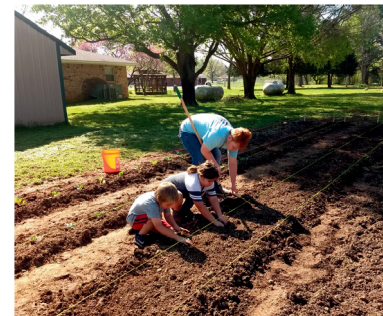
Tending a Summer project, the Mission garden...planting potatoes