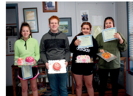
...and about to eat it, too - at the celebration of birthdays earlier this year